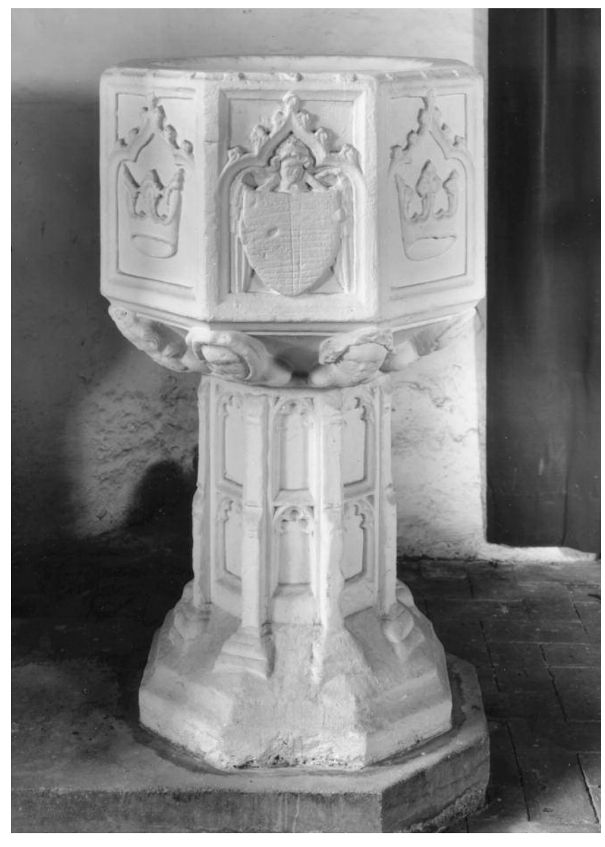
The 15th-century font