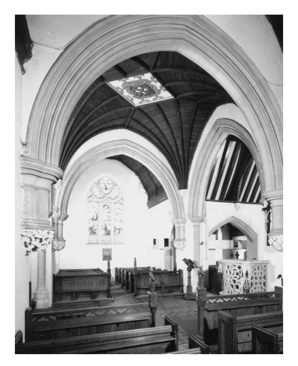
THE CHURCHES CONSERVATION TRUST LONDON