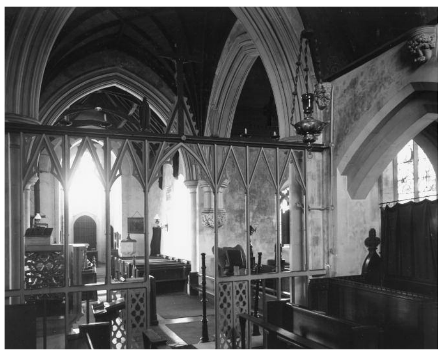
Interior looking north-west, through the 19th-century rood screen (ENGLISH HERITAGE. NMR.)

Drury placed a simple wooden screen beneath the chancel arch, surmounted by a crucifix and six candles, but this was removed long before the church was closed. He also covered the chancel walls with painted patterns – likewise removed many years ago. Some paintwork does still remain on the arch-braced chancel roof of 1851, which rests on intriguing stone corbels, including a serpent curled around a branch, an owl, some foliage in a human hand and a Green Man, with foliage sprouting from his mouth. The choir stalls, with their large poppyhead ends, have been moved forward in order to reveal the ledger-slabs in the floors behind them.